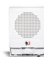
Genesis G4 Series Speaker/Strobe