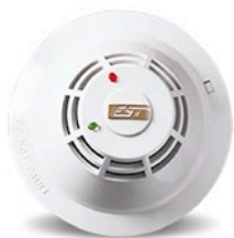
Signature Series 4D Multisensor Detector

Genesis products mount easily on standard electrical boxes, with plenty of room inside the box for wiring. For ease of verification, the selected candela and wattage settings remain visible through a small window on the device after the cover is closed. All mounting screws are captive so they won't go missing, and after installation they are concealed which provides a clean architecturally-pleasing appearance.