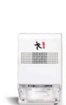
Genesis G1 Series Horn/Strobe