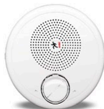
Genesis GC Series Speaker/Strobe