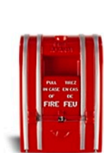
Signature Series 270 Pull Station