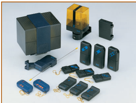
Access control accessories

Note: Operator specifications are approximate. Environmental factors can change the performance of the operator. Your installer will advise you regarding which model of operator will work best for your site and application.