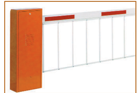
Skirted beam kit