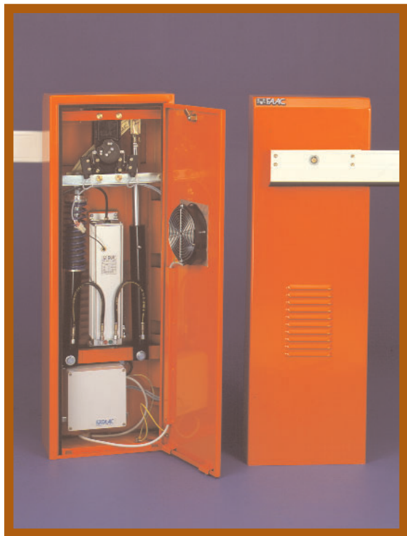
Model 640 Hydraulic Barrier Gate Operator

Access Control and Convenience for Demanding Applications.