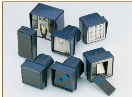
Access control accessories